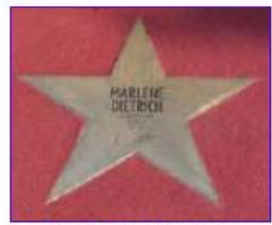
The „Marlene Star“ on „Boulevard of Stars“ in Berlin